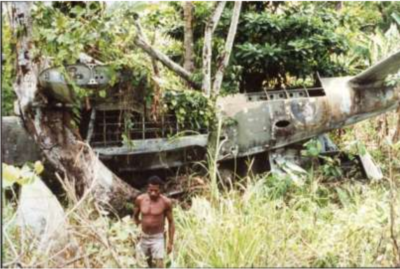
Boston fuselage behind the Spitfire on the edge of Vivegani Airstrip in 1972 [Langdon Badger]

The restored aircraft carries the firewall c/n 6S-272319, but this may have been installed during the restoration. It was fitted with a Merlin 46 and delivered to No. 8 M.U. on 23 January 1943, moving on to Mo. 215 M.U. at Dumfries on 8 February, where it was packed for shipment by sea to North Africa. EE853 was part of a shipment on the SS Sussex , which left England on 9 March 1943 for the Middle East. Because of threat of an invasion of Australia by the Japanese, who had already landed on the north coast of Papua New Guinea,