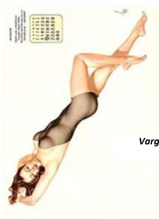
Vargas 1943 August Calendar