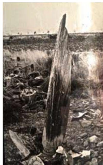
MK VIII four bladed wooden propeller

All the flyable aircraft in the Pacific were ferried back to the RAAF's No 6 Aircraft Depot at what is now Oakey Army Airfield in Queensland to be melted down for their aluminium. Other metals and parts were buried on the airfield. Langdon flew to Oakey in Aerostar VH-UYY, where he purchased a 'nil hour' RR Merlin 46,