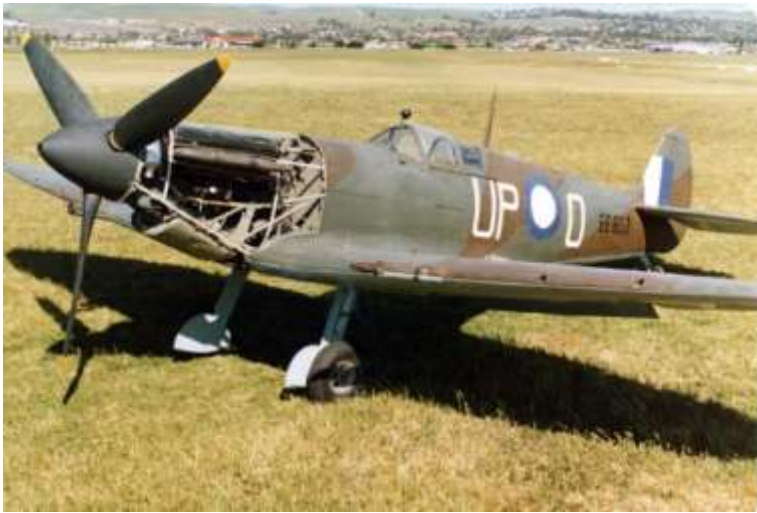
Taken at Parafield, then an all-over field, c1976 when UP-O was partially finished