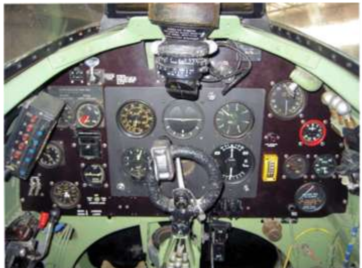
EE853 Cockpit, November 2013