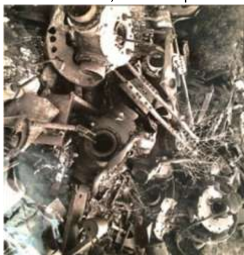
Stainless steel stabiliser carry through spar under prop hub [via Langdon Badger]

and from farmers' sheds found lots of small items. This engine, RR Merlin 46 94039, was built at Crew against Air Ministry contract C/Eng/405/C28a, tested on 16 January 1943 and dispatched on 21 January. The 46 was a development of the 45 with a larger diameter supercharger rotor and modifications to deliver increased performance at altitude. Maximum combat power was 1,415 BHP at 3,000 RPM +15 Boost and 14,000 feet. Langdon also had a bulldozer remove the dirt on two of the burial sites and found a perfect stainless steel horizontal stabiliser spar for his UP-O restoration, plus other items. Wooden propeller blades and other parts were burnt with 100-130 octane fuel. In all, 660 Spitfires were destroyed.