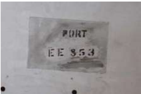
Detail of aircraft identification stencil

Finally, the photograph on the next page shows EE853 restored refurbished and repainted as currently displayed in the South Australian Aviation Museum at Port Adelaide.