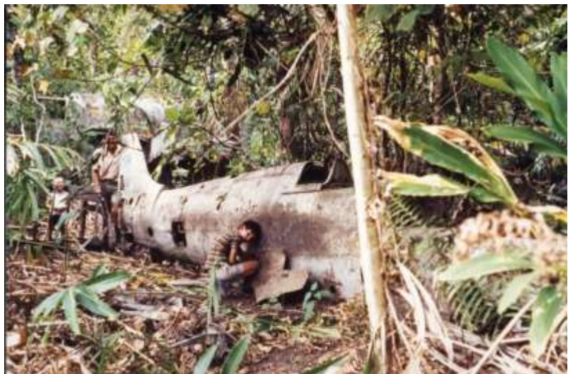
The fuselage of EE853 found on the edge of Vivigani airstrip in 1972 [Langdon Badger]

EE853 was built by Westland Aircraft Ltd at Yeovil, Somerset, with cockpit c/n WASP-20.484 as part of a batch of 200 Mk. V Spitfires ordered in September 1941 under Contract No. 124305/40. It was one of a total of 22,759 Spitfires of all Marks built.