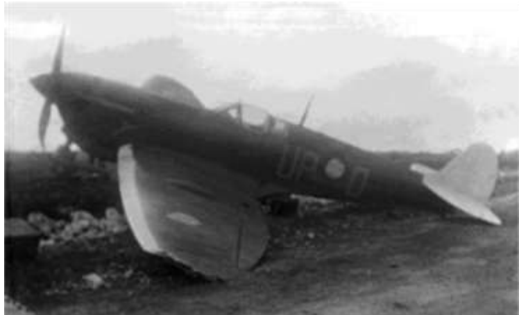
EE853 came to grief on 28 August 1943 when it swung on landing and ran off the runway, colliding with a low embankment. The "August Girl" mascot is just visible above the port wing leading edge.

Voges made a further 55 minute test flight on 29 July after which it was passed fit for service. FSGT Alec Chomley took her up on an altitude test flight on 1 August, reaching a recorded 35,000 feet over Vivigani.