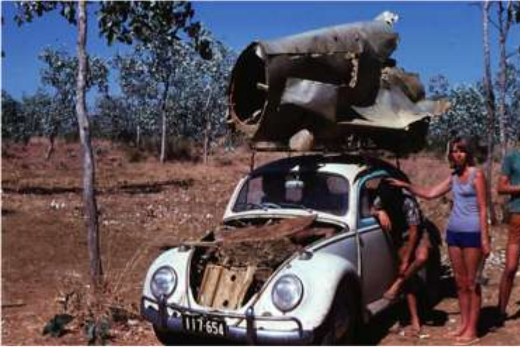
Genny and sons loading our Spitswagen borrowed from the pub [Langdon Badger]

534 landed against a red light without flaps or brakes, probably because of a pneumatic failure. He crashed into Sturm's aircraft, killing Sturm and causing his aircraft to burn. Crystal suffered a broken leg. 1